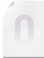
No printout permitted

Job Accounting Enables tracking of color and mono printing costs, easy monitoring of printing activity, and greater control of printer usage. It generates reports for administrative, bill-back or cost-accounting purposes. User permissions can be assigned and are stored on the printer—not on the network—so the system is totally secure.