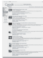
Crisp, clear Black & White